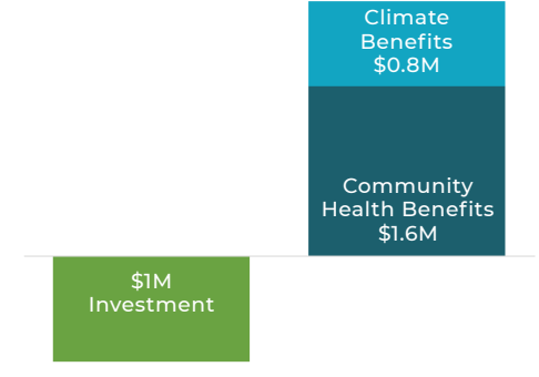
COST-BENEFIT PER $1 M INVESTED IN RESILIENT RECOVERY

Resilient Recovery Programs support labor (as opposed to capital) intensive industries that conduct more business in Washington. Every million dollars invested supports over ten jobs, which outperforms both the state average investment (7.4) and the state's largest industries (4.2).